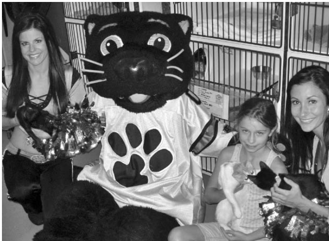
Pick a Panther promotion with Sir Purr and Topcats

We are off to a great start this year and much of that is due to conducting a strategic planning session with our board and staff in the last quarter of 2010. This session helped us examine where our organization has been, where it is headed and how it can best serve the members of the Charlotte Mecklenburg community. We recognize that no amount of reflection on the past or planning for the future would allow us to be successful in fulfilling