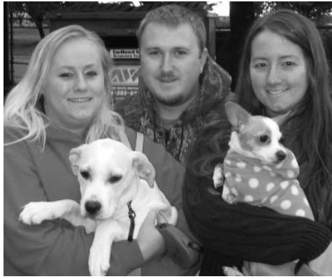
Patrons of the fall Vaccine Clinic

In addition, our veterinarians began doing