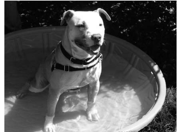
Adopt a Bull promotion

We were fortunate to have touched the lives of approximately 12,000 people and their pets through our adoption and spay/neuter services. We conducted special adoption promotions for long-term shelter residents, fabulous felines in conjunction with the Carolina Panthers and our precious pit bulls as we raised awareness about the many wonderful attributes of the breed. We also conducted our spring and fall vaccine clinics which were among the most well-attended we have ever