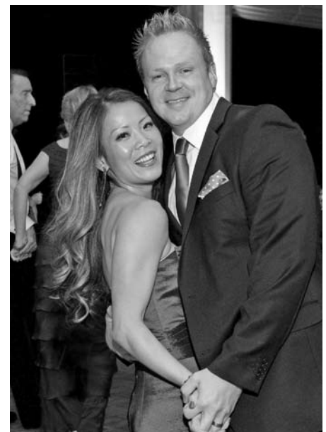
Guests dancing the night away