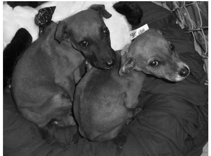
Donner and Comet

Donner and Comet flourished in foster care and eventually they were able to play like normal puppies, enjoying the grass and sunlight. Both puppies were happily adopted into loving families within weeks of returning to the shelter. They had tripled in size and will grow up to be healthy happy dogs.